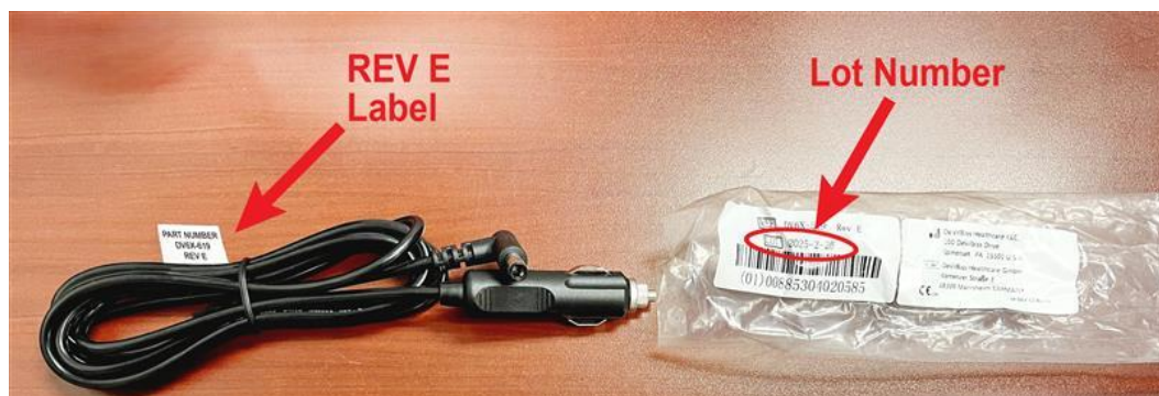
Figure 1: “Rev E” label and lot number placement