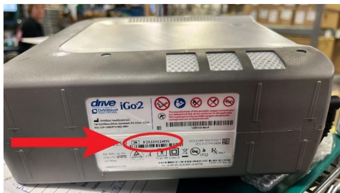
Figure 2: Serial number placement on iGo®2 POC Device